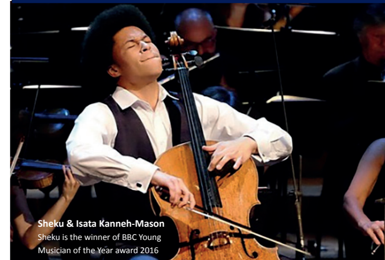
Sheku & Isata Kanneh-Mason Sheku is the winner of BBC Young Musician of the Year award 2016